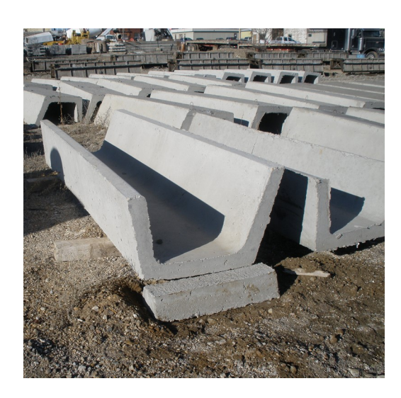
Fenceline or "J-Type" Bunk

Concrete feed bunks can be moved if necessary and retain good resale value.