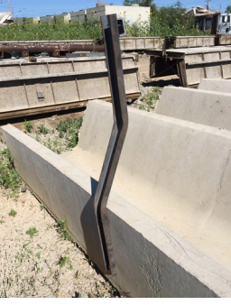
Bunk Fenceline Post