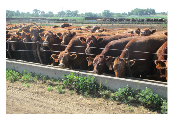
Feed Bunk Styles Available